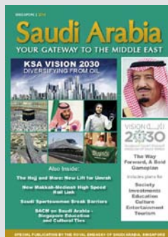
Saudi Arabia Your Gateway to the Middle East