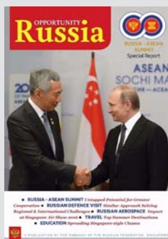
Opportunity Russia 2016

Click on the cover to read or download the issue