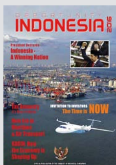
Opportunity Indonesia 2016