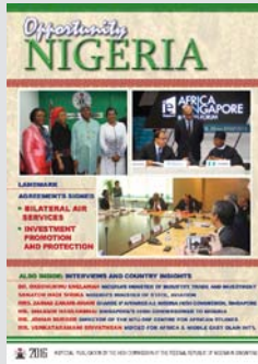
Opportunity Nigeria 2016