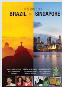
It's Time for Brazil in Singapore 2016