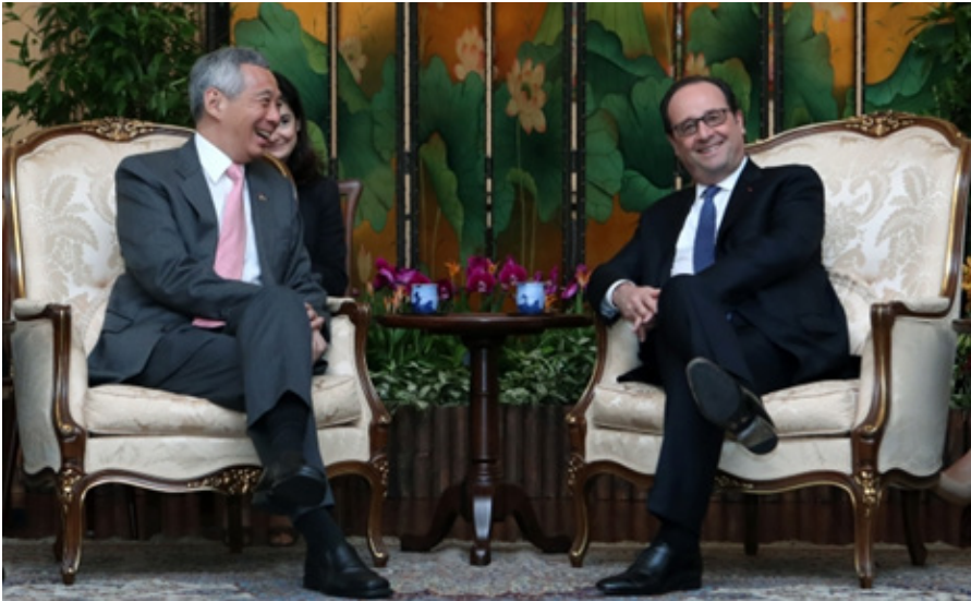
Congenial atmosphere - French President Hollande (right) calling on PM Lee

While reaffirming the increasingly warm relations and bilateral ties between the Republic of Singapore and the Republic of France during the State Visit of President François Hollande to Singapore from 26 to 27 March 2017, both President Hollande and Prime Minister Lee Hsien Loong also agreed to intensify cooperation on innovation between the two countries. Both countries have prioritised the strengthening of their respective innovation ecosystems, including programmes to promote research and development as well as support entrepreneurship in innovative sectors.