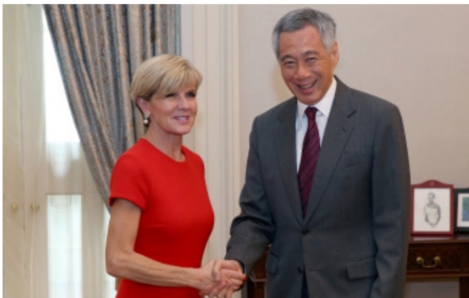
A warm welcome by PM Lee Hsien Loong for Australia's Minister for Foreign Affairs, Julie Bishop.

During Australia's Minister for Foreign Affairs Julie Bishop's 2-day visit (13th - 14th March 2017) to Singapore she had reaffirmed the "excellent relations" between Singapore and Australia, and was especially pleased to note the progress made by the implementation of the Singapore-Australia Comprehensive Strategic Partnership (CSP).