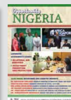
Opportunity Nigeria 2016