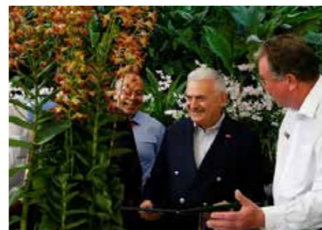
Hybrid orchid 'Dendrobium Binali Yildirim' named in honour of the Turkish Prime Minister at Singapore's National Orchid Garden.