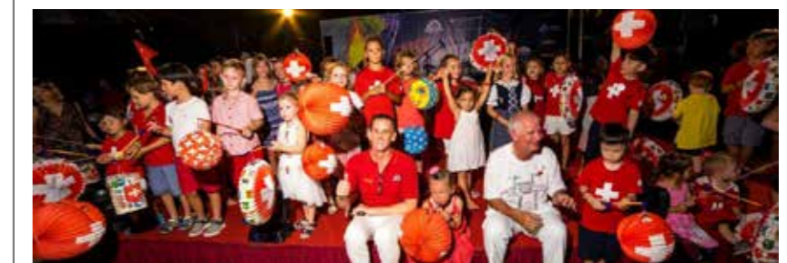
The party mood moved on to the Swiss Club for more fun and spirited celebration by the Swiss community and friends in Singapore!