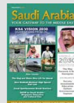
Saudi Arabia Your Gateway to the Middle East