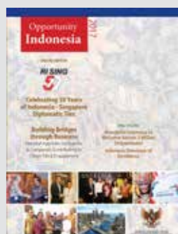
Opportunity Indonesia 2017

© Copyright 2016 by Sun Media Pte Ltd. All material in this newsletter is strictly copyrighted and all rights reserved. No part of this publication may be reproduced in whole or in part without prior written permission of the copyright holder. All facts are correct at the time of publication. While every effort has been made to ensure the information that appear in this newsletter is correct at the time of production, changes do occur and Sun Media Pte Ltd shall not be liable for any errors, omissions or inaccuracies that occur. The views and opinions expressed in this article are those of the authors and do not necessarily reflect the official policy or position of any foreign missions in Singapore.