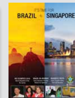
It's Time for Brazil in Singapore 2016