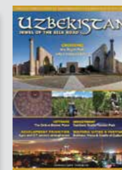
Uzbekistan Jewel of the Silk Road