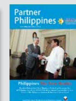
Partner Philippines 2017