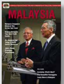
Opportunity Malaysia 2016