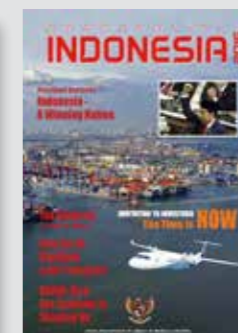
Opportunity Indonesia 2016