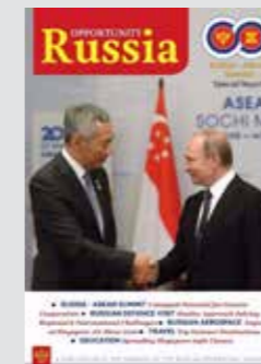
Opportunity Russia 2016

Click on the cover to read or download the issue