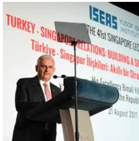
PM Binali Yildirim delivered the 41st Singapore Lecture

Last year, Turkey was Singapore’s 46th largest