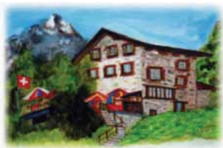
Examples of his art on his name card (above) and canvass (right).

While he was in Hotel Indonesia, he was happy to train youngsters and the newcomers in the art of western-style pastry making which was then new to Indonesia. He said, "In those days even getting all the ingredients for the pastries was hard, so we would often have to improvise and also make a list of items that had to be imported to get the best results." The hotel gave him opportunities to share his craft in other properties in the region and he participated in the opening of Inter-Continental Hotels in Singapore and Hotel Bali in 1963 and 1966 respectively.