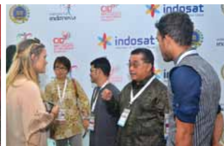
Diaspora participants at work and play during the 3rd CID