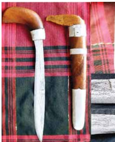
Kawali Geeong blade