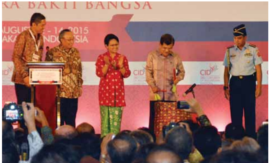
Indonesia Vice-President Jusuf Kalla (2nd from right) did the honours of opening this year's Congress