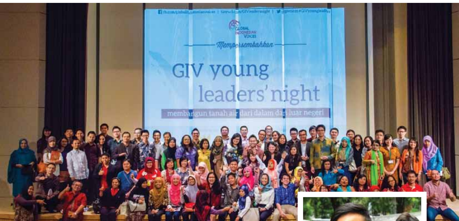
Participants of GIV Young Leaders' Night gathered after the panel discussion on 'Building Indonesia from Overseas and from Home' held in Singapore on 22 December 2013