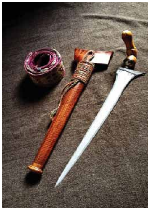
Examples of Bugis weaponry (above) keris with wooden sheath and spearheads (above right)