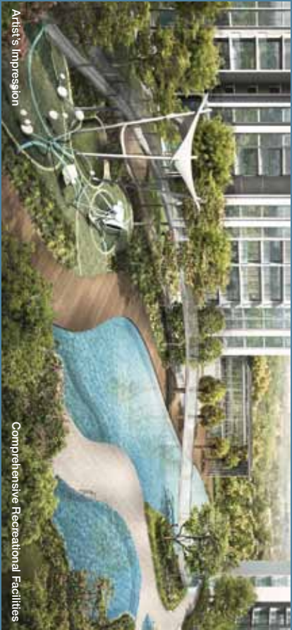
Comprehensive Recreational Facilities

Developer: Pinehill Investments Pte. Ltd. • Developer's Licence No.: C1085 • Tenure of Land: Leasehold estate of 99 years commencing from 8 April 2013 • Encumbrances on land: Mortgage No. ID/441524P to DBS Bank Ltd • Expected Date of Vacant Possession: 31 December 2019 • Expected Date of Legal Completion: 31 December 2022 • Lot & Mukim No.: Government Resurvey Lot No. 17828A of Mukim 18 at Ang Mo Kio Avenue 2 • Building Plan Approval No & Date: BP No. A1259-01301-2013-BP01 (4 Nov 2013) BP No. A1259-01301-2013-BP02 (20 Nov 2013)