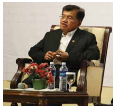
Vice-President Jusuf Kalla delivered a keynote address and took questions from the floor