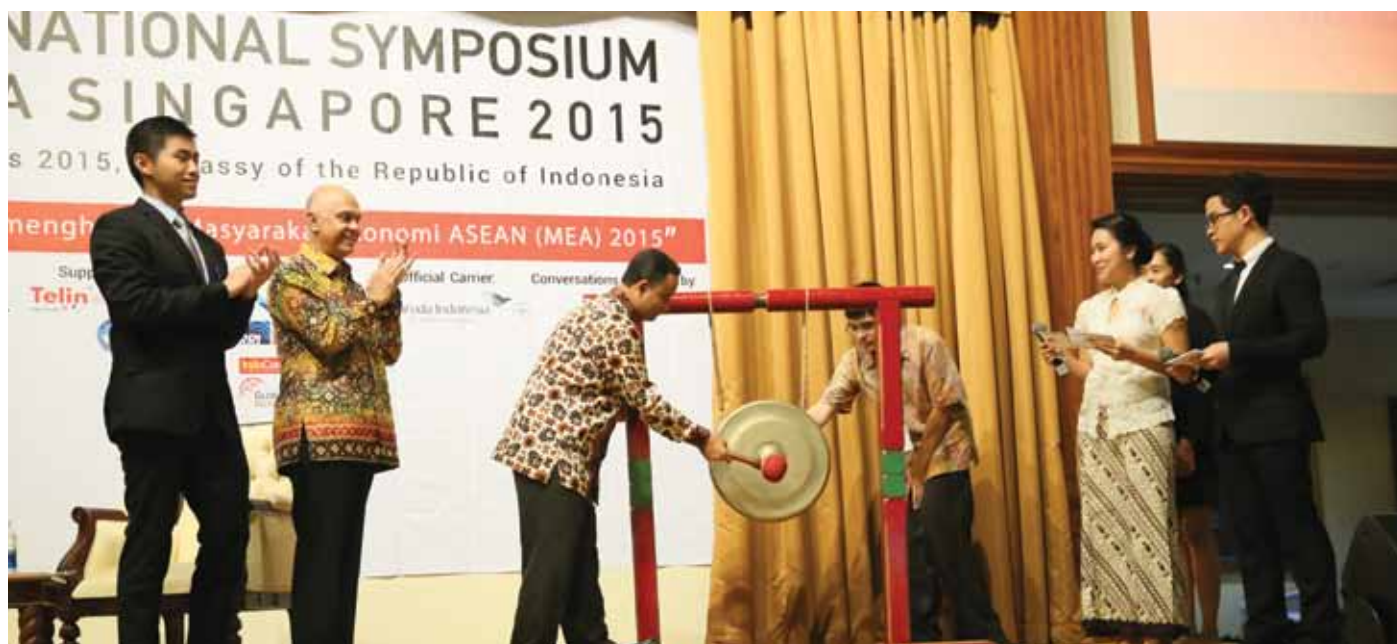
Indonesian Minister of Education & Culture, Dr Anies Bawedan, hits the gong to officially launch the OISAA International Symposium