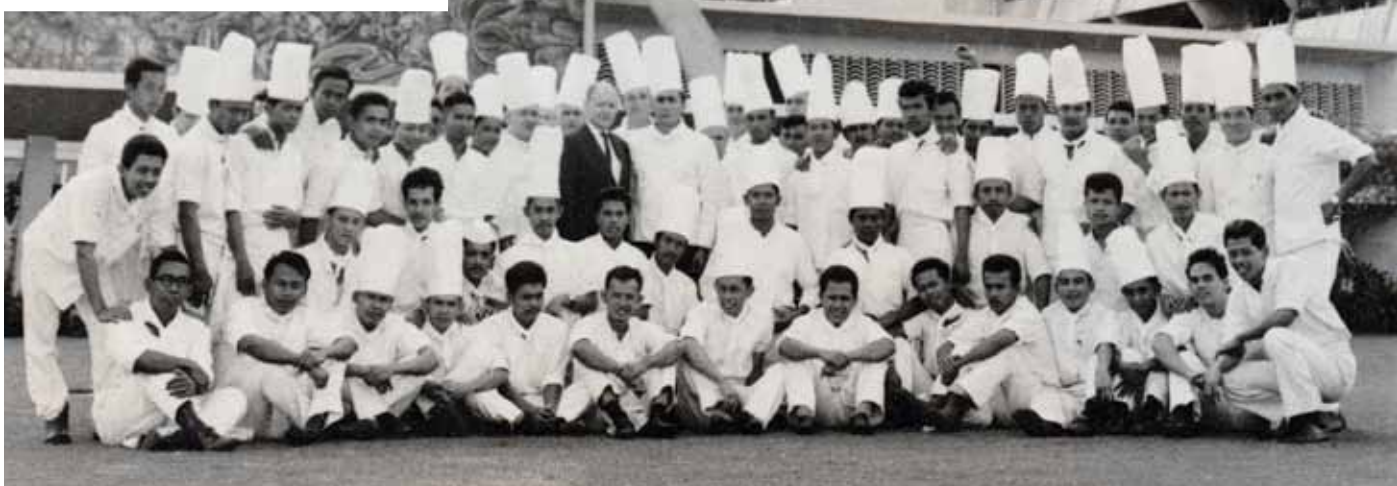
(Inset) This 28 roses cake was a hit with President Sukarno's wife. (Above): The top pastry chef surrounded by the cooking staff of Hotel Indonesia