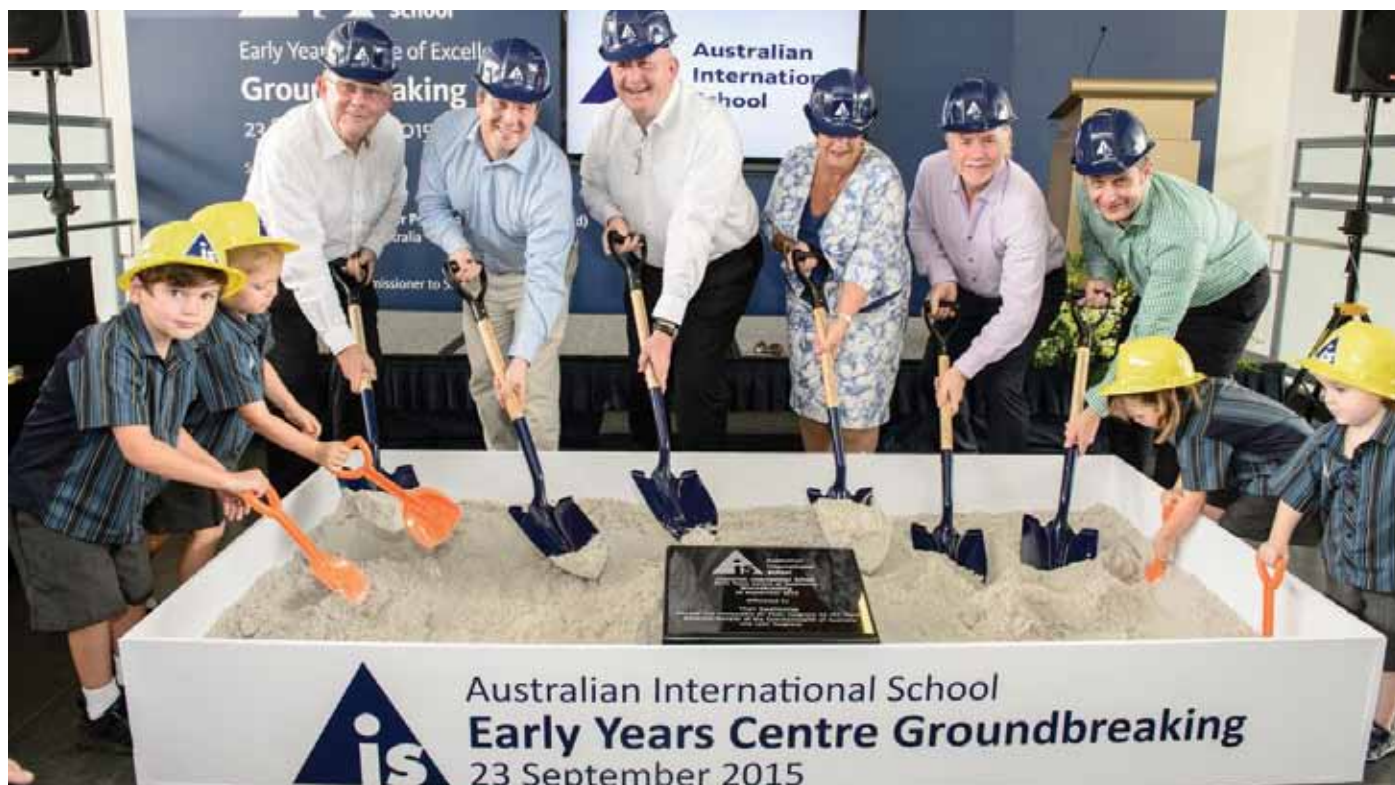
The Honourable Sir Peter Cosgrove, the Governor-General of Australia and Lady Cosgrove (5th & 6th from left resp) leads the ground breaking ceremony for the Early Years Centre