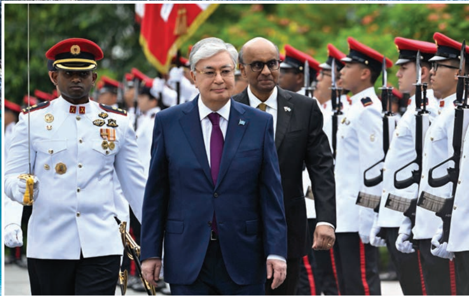
President of the Republic of Kazakhstan, His Excellency Kassym-Jomart Tokayev, during his visit to Singapore.

TAKING STOCK FOLLOWING PRESIDENT OF THE REPUBLIC OF KAZAKHSTAN, HIS EXCELLENCY KASSYM-JOMART TOKAYEV'S STATE VISIT TO SINGAPORE IN MAY 2024