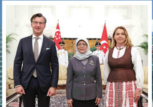
The Ambassador of the Republic of Lithuania His Excellency Gediminas Varvuolis