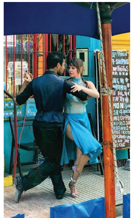
PM Lee Hsien Loong came across this tango display at Barrio La Boca on his first day in Buenos Aires.

PM Lee and President Macri welcomed the good progress made on Bilateral Investment Treaty (BIT) negotiations and looked forward to the conclusion of negotiations by the first half of 2019. They also agreed to start negotiations on an Avoidance of Double Taxation Agreement (DTA) in 2019. The finalisation of the BIT and DTA will boost investor confidence and facilitate greater trade and investment flows between Singapore and Argentina