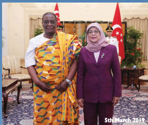
The High Commissioner of the Republic of Ghana HE Frank Okyere