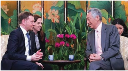
HE Michael Kretschmer and PM Lee: They agreed there was potential to strengthen economic cooperation

The Minister-President of the Free State of Saxony of the Federal Republic of Germany, Mr Michael Kretschmer visited Singapore on a working trip from 14th to 16th March 2019. According to a Ministry of Foreign Affairs statement he called on Prime Minister Lee Hsien Loong and reaffirmed the warm ties between Singapore and Saxony, and agreed there was potential to strengthen economic cooperation. They also exchanged views on regional and global developments.