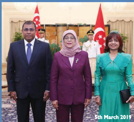
The Ambassador of the Republic of Maldives HE Abdulla Mausoom