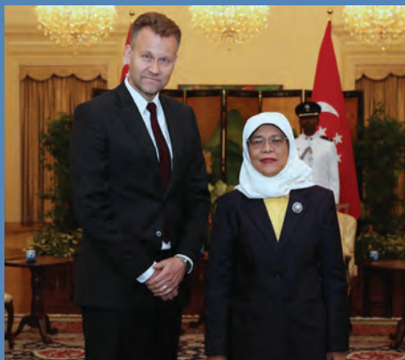
The Ambassador of the Republic of Finland HE Antti Vänkä