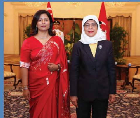
The High Commissioner of the Democratic Socialist Republic of Sri Lanka HE Sashikala Premawardhane