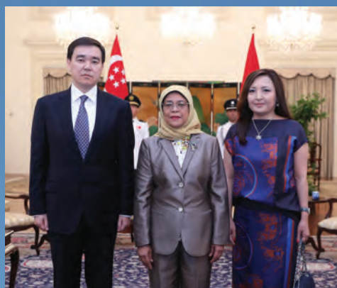
The Ambassador of the Republic of Kazakhstan HE Arken Arystanov