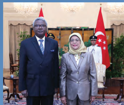
The Ambassador of the Republic of Mali HE Sékou Kassé