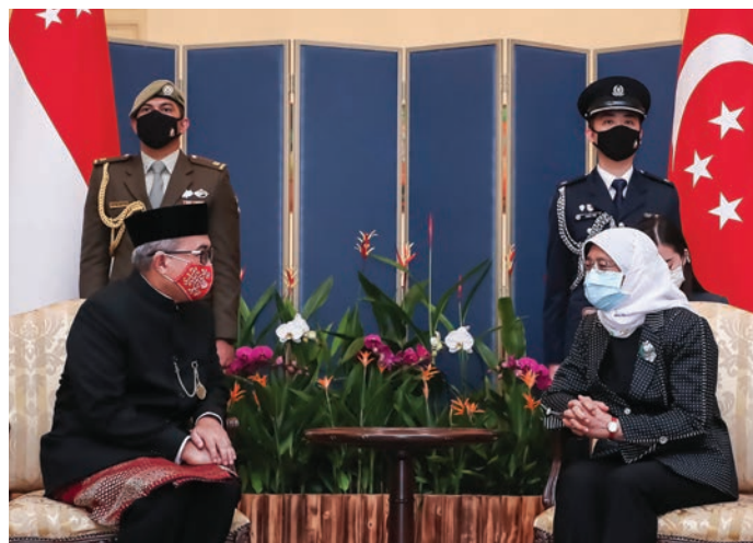
His Excellency Ambassador of the Republic of Indonesia Suryo Pratomo