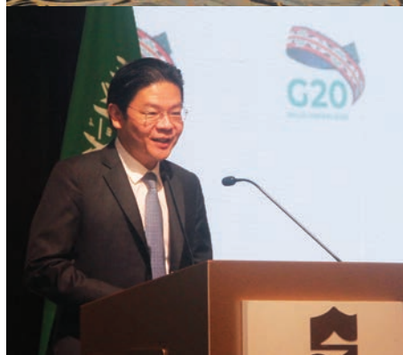
(Top row from left): Minister Lawrence Wong and Ambassador Saad Saleh; Dr Fahad Almoubarak, Minister of State and G20 Sherpa of Saudi Arabia. (Left): Singapore was represented by its Minister of Education and Second Minister of Finance Mr Lawrence Wong. (Above and below): A rare meeting of the diplomatic corps during COVID-19 organised by the Saudi Embassy that followed strict social distancing protocols

A special commemorative event was organised by the Royal Embassy of the Kingdom of Saudi Arabia (KSA) for the G20 Presidency by the Kingdom on 16th November 2020 at the Shangri-La Hotel. H.E. Saad Saleh Alsaleh welcomed almost 50 guests which included the Singapore Government's representative Mr Lawrence Wong, Singapore's Minister for Education and Second Minister for Finance.