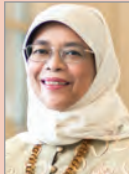
H.E. Halimah Yacob