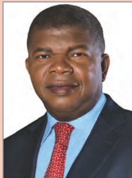
H.E. João Manuel Gonçalves Lourenço