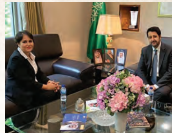
● Saudi Arabia - Amb Abdullah Mohammed AlMadhi