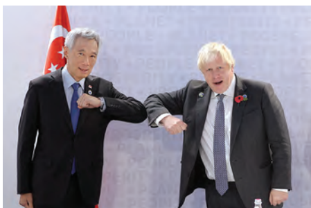
On the sidelines in Rome: PM Lee met UK PM Boris Johnson and looked forward to the speedy conclusion of negotiations on the UK-Singapore Digital Economy Agreement

SINGAPORE was invited to the G20 Rome Summit Meeting where issues related to Sustainability and the recovery of the global economy from COVID was discussed in Rome, Italy. PM Lee said Singapore commended the Italian Presidency for galvanising global cooperation to quell this pandemic and to prepare for future health crises. The proposed reforms and initiatives to strengthen healthcare financing are important first steps as the current global system for public health is significantly underfunded, and mobilising concerted action takes "far too long". Singapore's Senior Minister Tharmar Shanmugaratnam co-chaired the G20 High-Level Independent Panel and PM Lee said: "Singapore is glad to have contributed to this panel. We