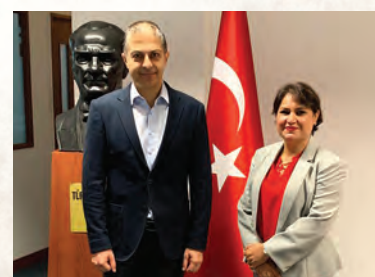
● Turkey - Amb Mehmet Burçin Gönenli