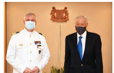
The German Navy Chief also called on Singapore's Minister for Defence Dr Ng Eng Hen during his visit here