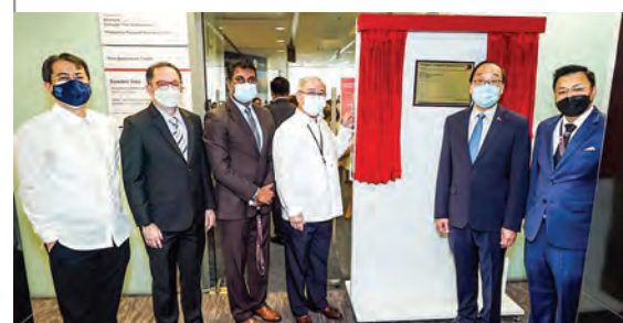
Secretary Teodoro Locsin Jr. inaugurated the first Philippine ePassport Renewal Center in Singapore.