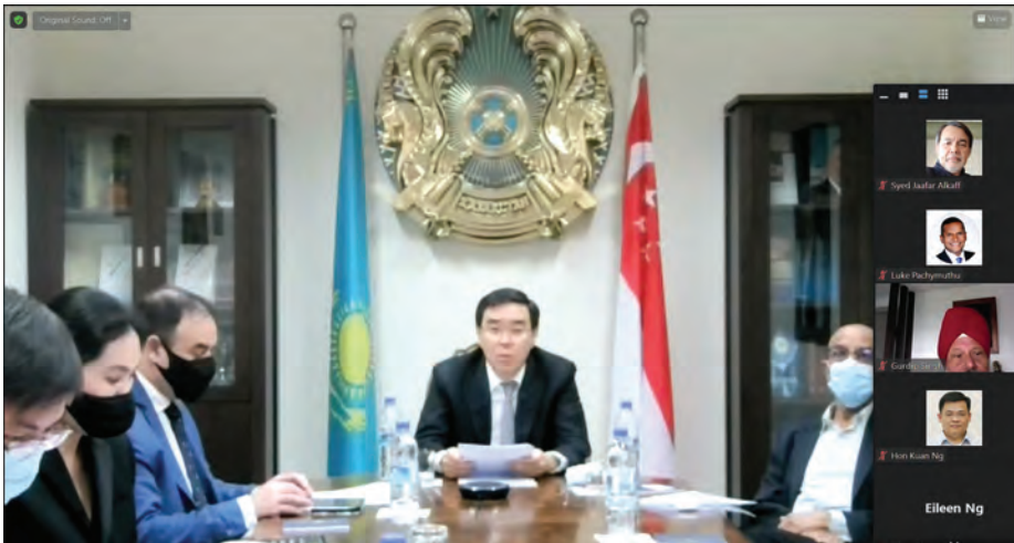
Ambassador Arystanov (centre) chairs hybrid press conference with leading media representatives in Singapore and the region

AMBASSADOR Arken Arystanov called a hybrid press briefing on 18th January to give the latest updates on developments in Kazakhstan and answer questions following the surprise attacks in the country. The Ambassador confirmed that the demonstrations and attacks on administrative as well as military buildings that erupted earlier in January have died down and the government is firmly in control of law and order in the country.