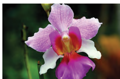
Singapore's national flower is a hybrid orchid - the Vanda Miss Joaquim