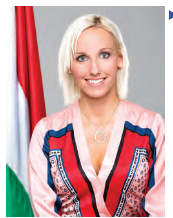
Strategically it's better to be underestimatedthere is more chance to amaze