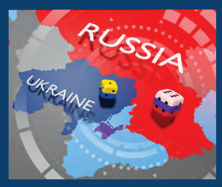
United Nations Demands End to Russian Offensive Safety of Ukranians Top Priority