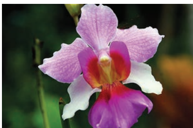
Singapore's national flower is a hybrid orchid - the Vanda Miss Joaquim