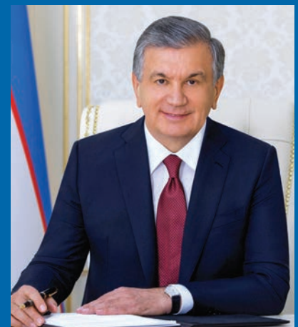
President of Uzbekistan Shavkat Mirziyoyev