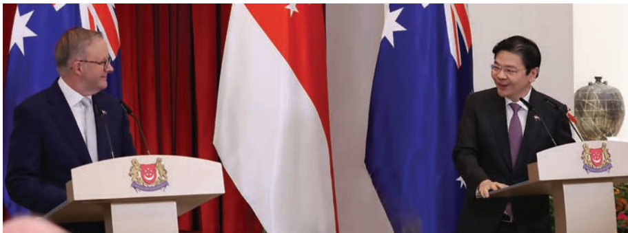
(From left): Australian PM Mr Anthony Albanese and Acting PM Mr Lawrence Wong at the Joint Press Conference held at the Istana on 2nd June 2023

It was Prime Minister Anthony Albanese's first official visit to Singapore where he delivered the keynote address at this year's Shangri-La Dialogue and attended the Annual Leaders' Meeting