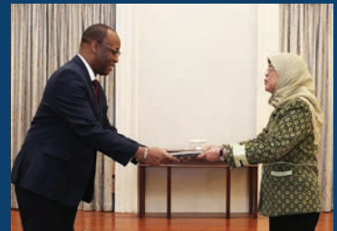
H.E. ABDOU SALAM DIALLO AMBASSADOR OF THE REPUBLIC OF SENEGAL