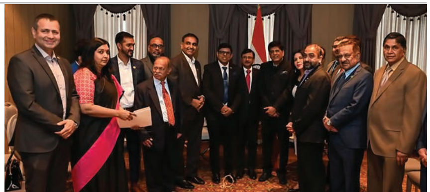
Minister of Textiles, Minister of Commerce and Industry and Minister of Consumer Affairs, Food and Public Distribution at People of Indian Origin Chamber of Commerce and Industry in Toronto, encouraged participants to work towards strengthening Brand India

Under the umbrella of DPIIT, Invest India has established a dedicated desk to guide and support these investors, by simplifying their trade and investment journey. This desk acts as a central point for addressing the specific needs and queries of the