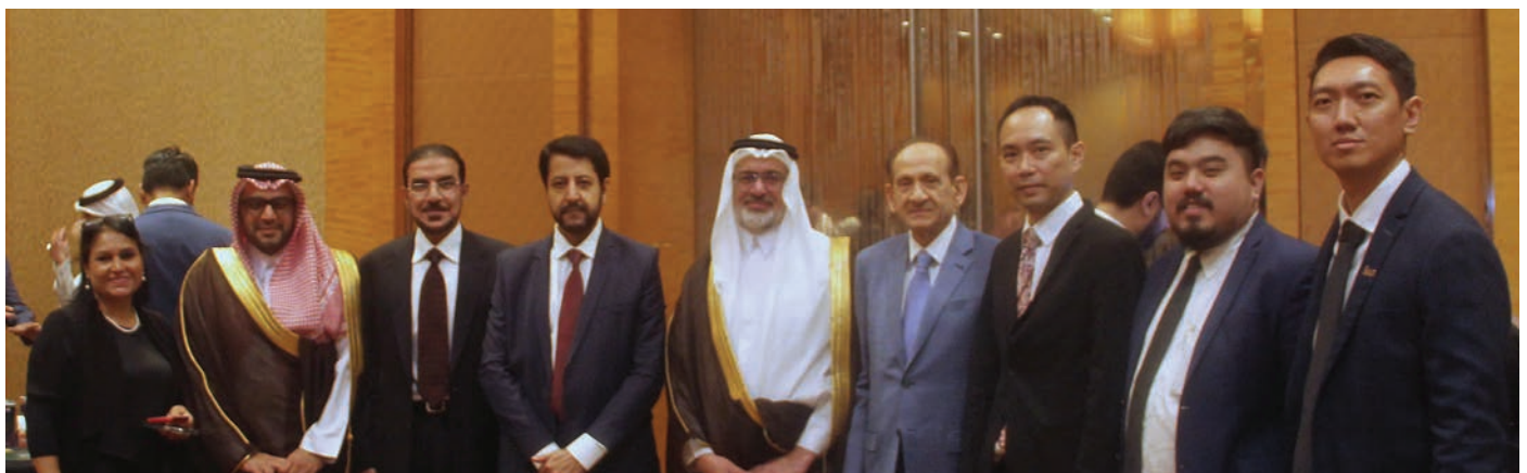
VIPs and guests - much to talk about and interaction to know more

For the full report visit online: www.indiplomacy.com