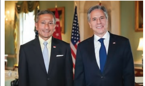
Dr V. Balakrishnan and US Sec. of State Antony J. Blinken meeting highlights

SINGAPORE'S Minister for Foreign Affairs Dr Vivian Balakrishnan met US Secretary of State Antony J. Blinken on 16 June 2023. Both officials emphasised their commitment to a stable, rules-based multilateral order. They welcomed new areas of bilateral cooperation in cybersecurity, climate change, and space. Minister Balakrishnan appreciated the US' engagement with the region and ASEAN, while Secretary Blinken expressed hope for a constructive visit to China. They both also announced the Updated US-Singapore Climate Partnership (USCP) to intensify efforts in various areas of collaboration focusing on regional energy transition, low- and zero-emission technologies, nature-based solutions and carbon markets, urban decarbonization and resilience, as well as capacity building.