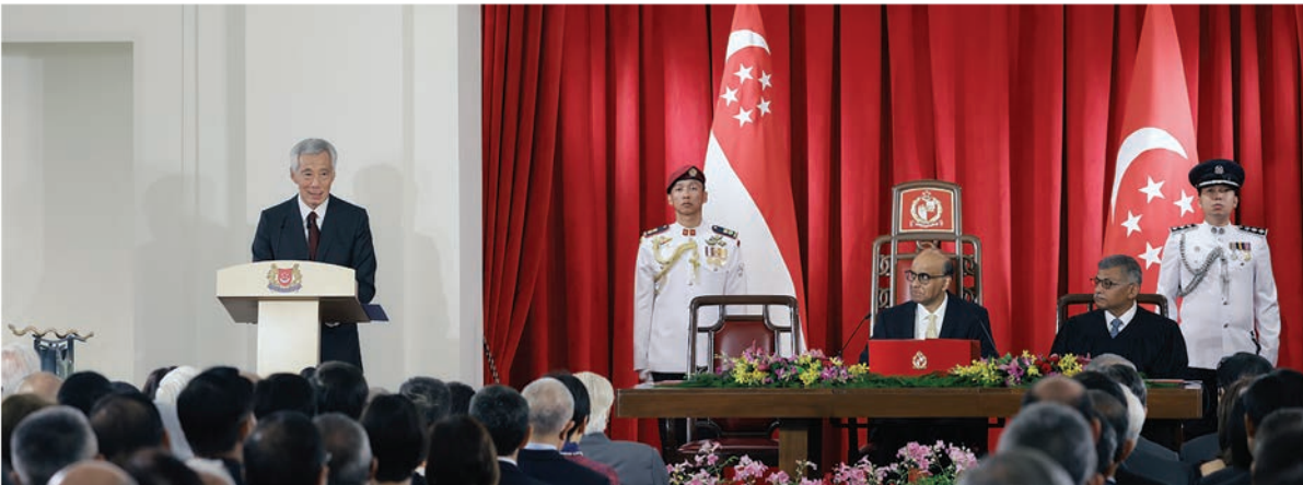
President Swearing-in Ceremony at the Istana on 14th September 2023

MORE than 70% of Singaporeans voted for Mr Tharman Shanmugaratnam as their ninth President. He won over two rival candidates to be the first non-Chinese candidate to be directly voted to the presidency. At the Swearing-in Ceremony held at the Istana on 14th September 2023, Prime Minister Lee Hsien Loong congratulated the new President and said: "The strong vote you garnered shows the regard and support voters had for you and your message of unity - Respect for All." The 66-year old President started out as an economist in the Monetary Authority of Singapore to rise up the ranks to become its Managing Director, and later, as a Minister became its Chairman. He has held several ministerial portfolios that included Education and Finance before becoming the Deputy Prime Minister, Coordinating Minister for Economic and Social Policies and most recently, Senior Minister.