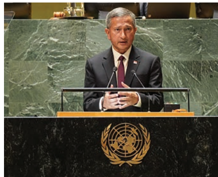
Singapore Foreign Minister Dr Vivian Balakrishnan's National Statement at the 78th U.N. General Assembly on 18th Sept 2023 called on members to accept and respect diversity in views in a multilateral system and urgently asked for an inclusive global dialogue on AI.