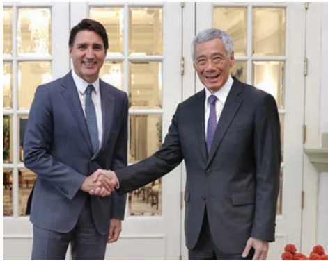
Prime Minister of Canada Justin Trudeau was on a working visit to Singapore from 7th to 8th September 2023 and met Prime Minister Lee Hsien Loong at the Istana. They discussed international developments and PM Lee congratulated Prime Minister Trudeau on the recent upgrading of ASEAN-Canada relations to a Strategic Partnership.