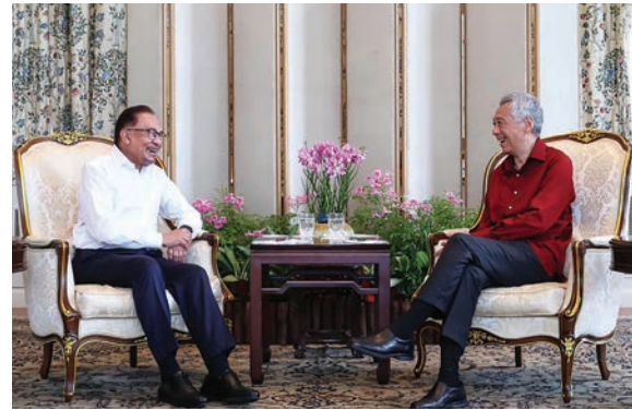
Malaysia's Prime Minister and Minister of Finance Dato' Seri Anwar Ibrahim visited Singapore on 13th September 2023. Prime Minister Lee Hsien Loong hosted PM Anwar and his wife, Dato' Seri Dr Wan Azizah Dr Wan Ismail, to tea. PM Anwar spoke at the Milken Institute Asia Summit 2023 and was accompanied by Minister of Investment, Trade and Industry Tengku Datuk Seri Utama Zafrul Tengku Abdul Aziz and Minister of Foreign Affairs Dato' Seri Diraja Dr Zambry Abd Kadir.