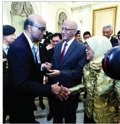
Then President-Elect Tharman Shanmugaratnam at the outgoing President Halimah Yacob's Farewell Ceremony on 13th September 2023

MORE than 70% of Singaporeans voted for Mr Tharman Shanmugaratnam as their ninth President. He won over two rival candidates to be the first non-Chinese candidate to be directly voted to the presidency. At the Swearing-in Ceremony held at the Istana on 14th September 2023, Prime Minister Lee Hsien Loong congratulated the new President and said: "The strong vote you garnered shows the regard and support voters had for you and your message of unity - Respect for All." The 66-year old President started out as an economist in the Monetary Authority of Singapore to rise up the ranks to become its Managing Director, and later, as a Minister became its Chairman. He has held several ministerial portfolios that included Education and Finance before becoming the Deputy Prime Minister, Coordinating Minister for Economic and Social Policies and most recently, Senior Minister.