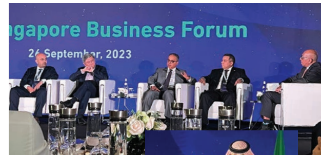
The Saudi Ministry of Commerce, National Competitiveness Center, Saudi General Authority of Foreign Trade, and Singapore Business Federation (SBF) organised the Saudi-Singapore Business Forum at the Mandarin Oriental Hotel on 26th September 2023 to discuss opportunities in furthering bilateral trade.