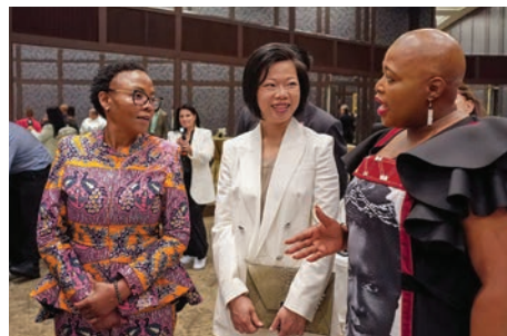
Singapore's Senior Minister of State at the Ministries of Foreign Affairs and National Development Ms Sim Ann was the Guest of Honour and Speaker at the South Africa-Singapore Women's Roundtable on 26th September 2023 with Ms Pinky Kekana, South African Deputy Minister in the Presidency for Planning, Monitoring and Evaluation. The Roundtable is one of the South African High Commission's South Africa Focus Week events.