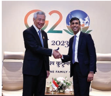
Prime Ministers Lee Hsien Loong and Rishi Sunak of Britain met on the sidelines of the G20 Summit in New Delhi where they issued a Joint Declaration to elevate Singapore-United Kingdom relations to a Strategic Partnership which includes Economic Cooperation; Defence, Security, Intelligence and Foreign Policy Cooperation; Climate, Sustainability, Green Economy and Energy Cooperation.