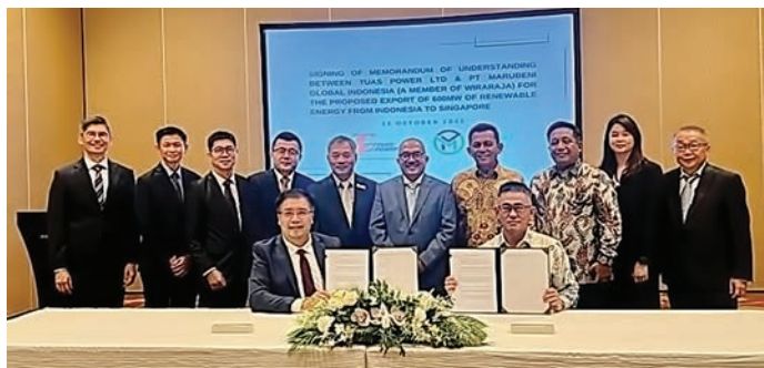
Storage System (BESS). The total investment for this ambitious project is estimated at a remarkable US$9 billion.

A milestone for the new and renewable energy (NRE) sector as PT Marubeni Global Indonesia, a key player in Batam with National Strategic Program (NSP) status, has entered into a Memorandum of Understanding (MoU) with Singapore's prestigious NRE company, Tuas Power. The signing ceremony took place on 23rd October 2023 and under this transformative partnership, Tuas Power is set to import environmentally friendly electricity generated by Marubeni in Batam. Marubeni, a subsidiary of the Wiraraja Group, will make substantial contributions by generating 4.1 GWp of solar energy and storing an additional 10 GWp in a cutting-edge Battery Energy