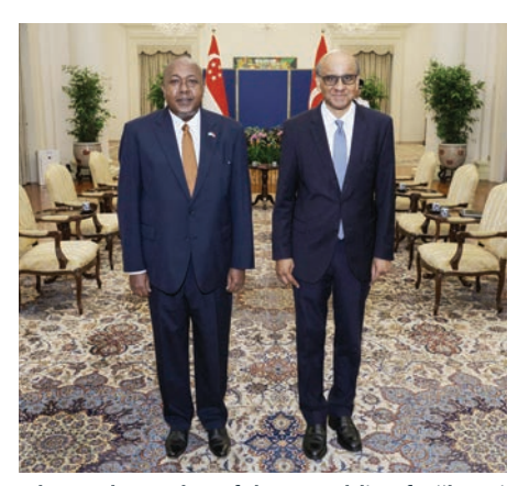
The Ambassador of the Republic of Djibouti His Excellency Ibrahim Bileh Doualeh

Brief introductory bios available online at indiplomacy.com