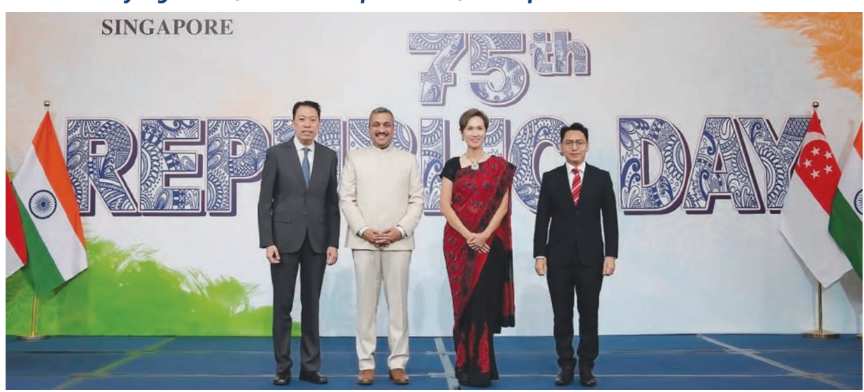
India's High Commissioner Dr Shilpak Ambule with Guest of Honour Minister Josephine Teo and her Parliamentary colleagues

The High Commission of India celebrates India's 75th Republic Day with a splendid reception, attended by dignitaries, members of parliament, and representatives from various sectors