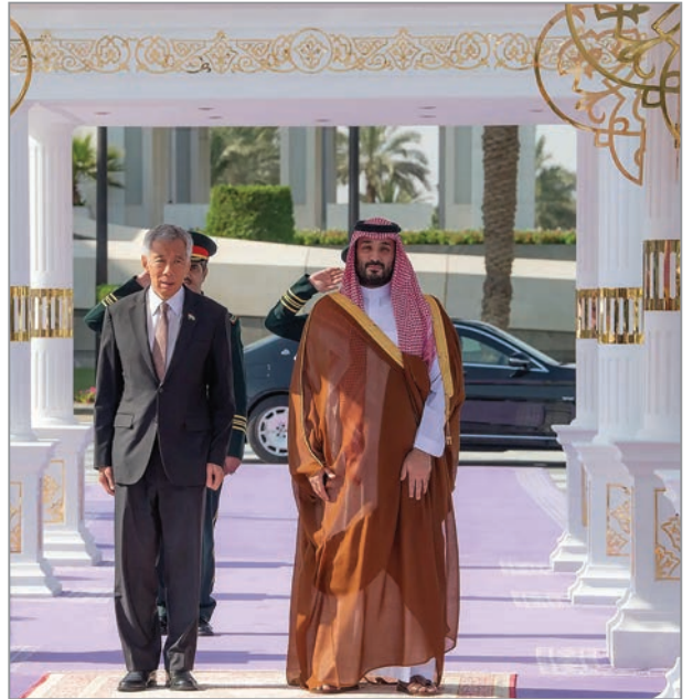
Prime Minister Lee Hsien Loong and Crown Prince and Prime Minister HRH Mohammed Bin Salman Al Saud agreed to elevate relations to Strategic Partners - Singapore's first with a Middle Eastern nation

In the economic, trade and investment fields, the two sides reviewed challenges in the global economy and discussed the common economic interests between the Kingdom and Singapore. The two sides welcomed the growth in the value of bilateral trade in 2022 by 51% as compared to 2021. They stressed the importance of mutual cooperation to enhance and diversify bilateral trade by tapping on and improving the Gulf Cooperation Council – Singapore Free Trade Agreement, as well as intensifying collaborations between their private sectors, in various fields including energy, digital economy, financial services, agricultural and food industries, and transport and logistics. The two sides affirmed the opportunities in investment partnerships provided by the programmes and projects of the Kingdom's Vision 2030 in various sectors, benefiting from the expertise and capabilities of Singa-