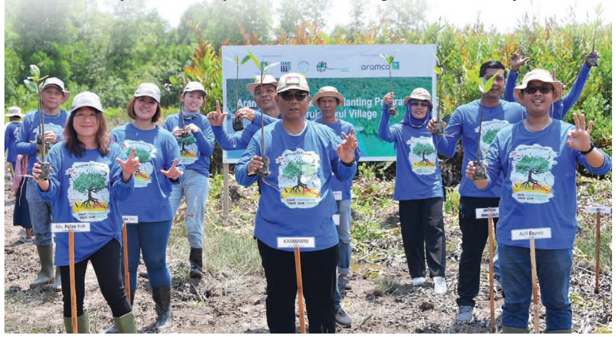
Aramco launched its Community-based Mangrove Conservation Programme in Buruk Bakul Village, in Bukit Batu, Riau, Indonesia, to restore four hectares of degraded mangroves in Indonesia

Aramco strives to create a culture that prioritizes understanding of ecological habitats, their plants and animals, and promotes their protection while creating value across the hydrocarbon chain