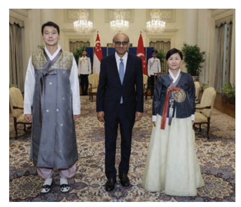
The Ambassador of the Republic of Korea His Excellency Hong Jin-wook