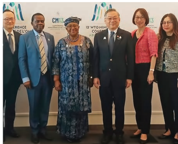
Minister Gan Kim Yong (3rd from right) had a series of meetings with the Director-General of WTO, Ngozi Okonjo-Iweala (4th from right) as well as his ASEAN counterparts, US Trade Representative and China's Minister of Commerce among others

Following the conclusion of the Joint Statement Initiative (JSI) on Investment Facilitation for Development (IFD) last year, Ministers will also discuss the incorporation of the JSI IFD into the WTO's legal framework at MC13. The JSI IFD will facilitate foreign direct investment and set international benchmarks on investment facilitation.