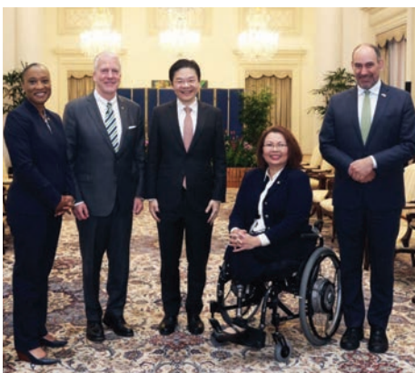
U.S. Congressional delegations, led by Senator Tammy Duckworth, Senator Dan Sullivan, and Representative Michael McCaul, visited Singapore for the Shangri-La Dialogue. They held high-level meetings with Prime Minister Lawrence Wong, Defence Minister Dr. Ng Eng Hen, and Foreign Minister Dr. Vivian Balakrishnan. Discussions focused on defense, security, and economic cooperation, celebrating 20 years of the US-Singapore Free Trade Agreement. The visit highlighted shared strategic interests and future collaboration opportunities.