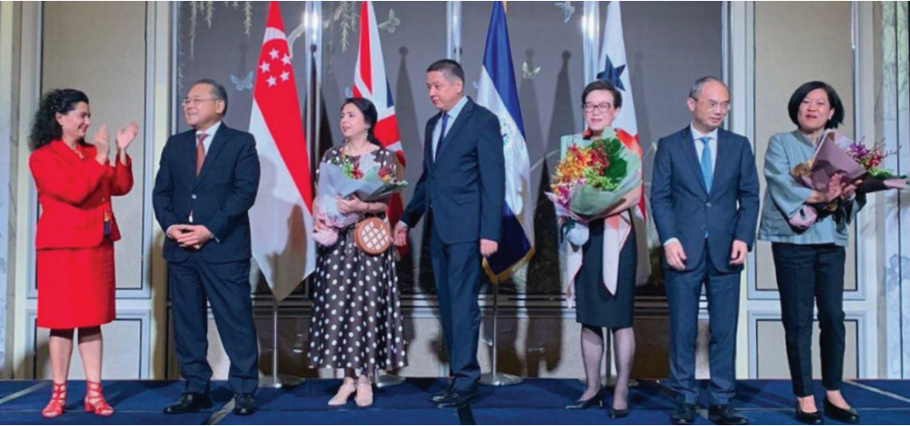
(Above): A warm welcome hand for the new diplomats and their spouses

The Diplomatic and Consular Corps (DCC) of Singapore bade a fond farewell honouring distinguished diplomats for their exceptional service and welcomed new heads of diplomatic missions to the city state