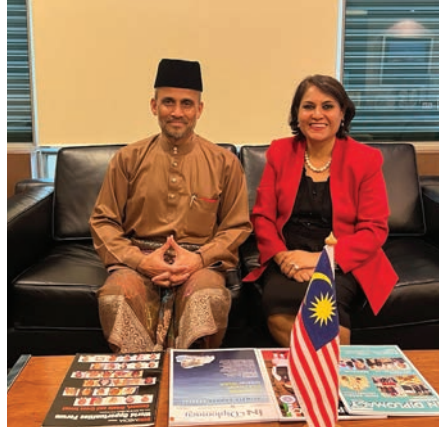
H.E. Azfar Bin Mohamad Mustafar, the Malaysian High Commissioner to Singapore