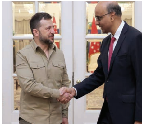
President Volodymyr Zelenskyy of Ukraine visited Singapore to attend the Shangri-La Dialogue. He met President Tharman Shanmugaratnam and Prime Minister Lawrence Wong. Discussions covered regional and international developments, emphasizing adherence to international law. They also explored potential bilateral cooperation in trade and economic relations. President Zelenskyy and Prime Minister Wong witnessed the signing of the Ukraine-Singapore Air Services Agreement, enhancing air connectivity and strengthening bilateral relations.