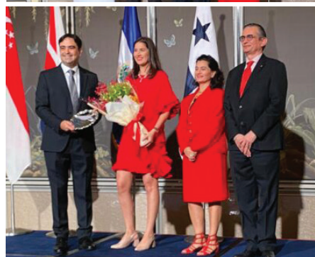
Leaving our shores our diplomats from (top) Britain, (middle) El Salvador and (above) Panama