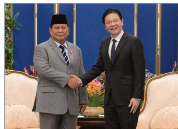
Indonesia's President-Elect and Defence Minister Prabowo Subianto visited Singapore for the Shangri-La Dialogue which was held from 31 May to 2 June 2024. He also met Prime Minister Lawrence Wong. They discussed enhancing bilateral cooperation in renewable energy, sustainability, and regional issues. Both leaders reaffirmed the strong bilateral and people-to-people ties between Singapore and Indonesia. The visit underscored the importance of continued collaboration and dialogue, reinforcing the robust relationship between the two nations.