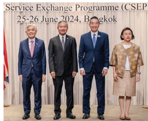
Service Exchange Programme (CSEP) 25-26 June 2024, Bangkok Singapore's Foreign Minister Dr. Vivian Balakrishnan visited Thailand and met with Deputy Prime Minister Anutin Charnvirakul and Foreign Minister Maris Sangiampongsa. They discussed enhancing bilateral relations through carbon credits collaboration and the Singapore-Thailand Civil Service Exchange Programme. High-level exchanges focused on defense cooperation, digital economy, and regional energy connectivity. The visit reinforced the strong partnership and mutual interests between Singapore and Thailand.