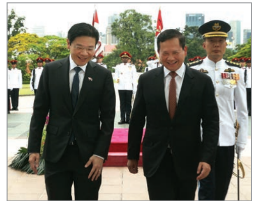
The Prime Minister of the Kingdom of Cambodia, Samdech Moha Borvor Thipadei Hun Manet, was on an Official Visit to Singapore from 18 to 19 June 2024. Prime Minister Hun Manet received a ceremonial welcome at the Istana this afternoon and called on President Tharman Shanmugaratnam. Prime Minister Hun Manet also had a bilateral meeting with Prime Minister and Minister for Finance Lawrence Wong, who hosted an official dinner in honour of Prime Minister Hun Manet. Prime Minister Hun Manet had a new orchid hybrid, Vanchoanthe Hun Manet, named in his honour.