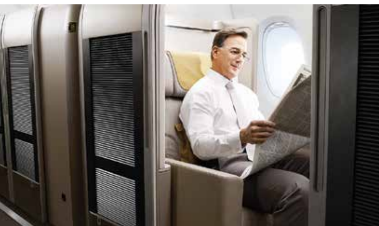
Asiana First Suite

As Asiana Airlines turned 30 this year on February 17, it can confidently revel in its long held position as one of the world's leading premium air carriers