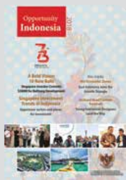
Opportunity Indonesia 2018