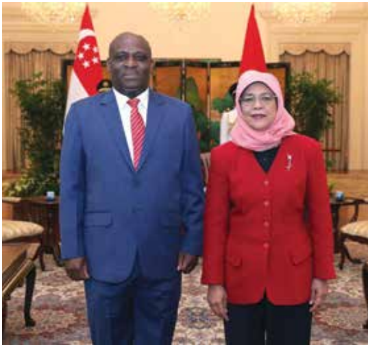
High Commissioner of the United Republic of Tanzania HE Baraka Haran Luvanda