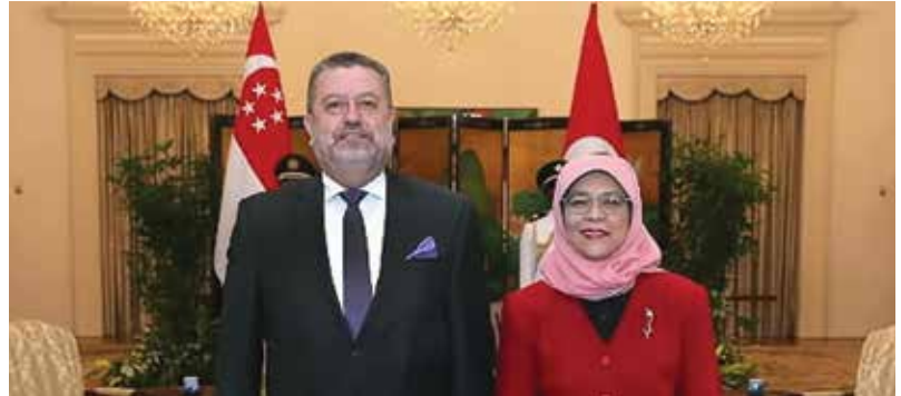
Ambassador of the Republic of Ecuador HE Fabián Valdivieso