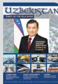
Uzbekistan Jewel of the Silk Road 2018