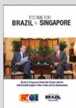
It's Time for Brazil in Singapore 2017