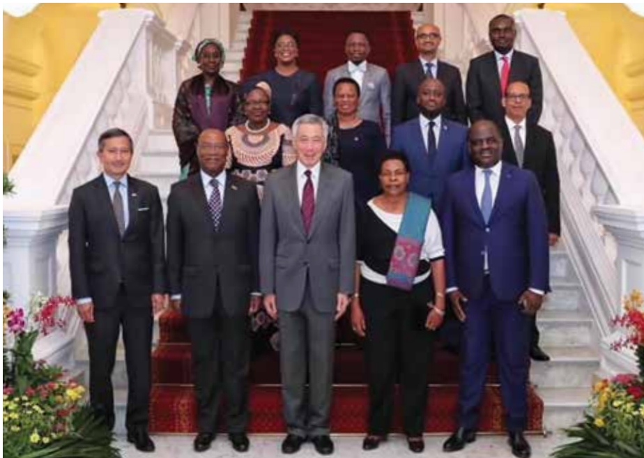
Prime Minister Lee Hsien Loong with participants of the Third Singapore-Sub-Saharan Africa High-Level Ministerial Exchange Visit, 28 August 2018.

Ministers from 12 African nations Djibouti, Ethiopia, Gabon, Ghana, Kenya, Mozambique, Namibia, Nigeria, Rwanda, South Africa, Tanzania and Uganda visited Singapore as part of the Third Exchange Visit (27th - 28th August 2018) with the theme on 'Singapore and Africa: Partner for Smart Cities'. They were welcomed by Singapore's Foreign Minister Dr Vivian Balakrishnan at the Ministry where he noted, "We have seen Africa develop at an impressive pace, and demonstrate incredible potential. Within the next two decades, Africa will possess the world's youngest population. By 2030, Africa's GDP is expected to reach US$3 trillion, buoyed by a rising middle class with strong consumption and of course, a very young, productive population."