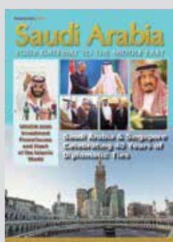
Saudi Arabia Your Gateway to the Middle East 2017

There will be times when it pays to directly delve deeper and focus on a particular subject, product, service or even country! Contact us to find out how we can help with any of your advertising, promotional or publicity objectives. Call Nomita or Swati tel: 6735 2972 or email: accounts@sunmediaonline.com