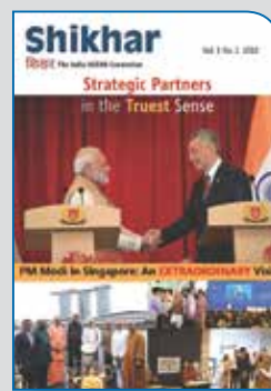
Shikhar Vol. 1 No. 2