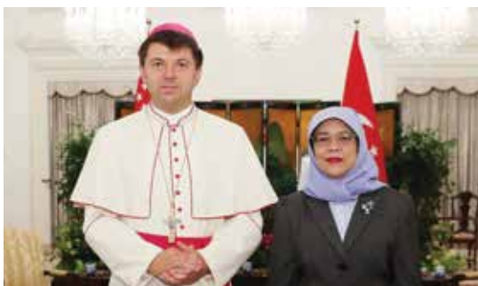
The Apostolic Nuncio of the Holy See HE Archbishop Marek Zaleski