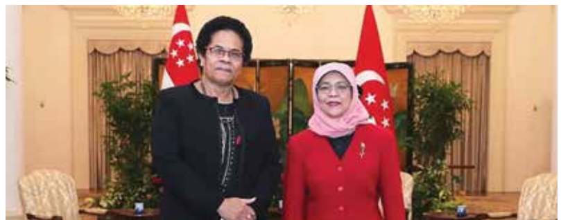
High Commissioner of the Republic of Fiji HE Seleima D. Veisamasama