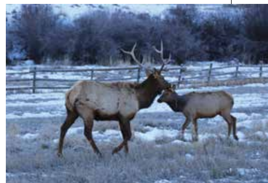
Elks at Hardware Ranch WMA in Cache Valley

Photography note: All photos taken using Canon 7D Mark II with 18-135mm kit lens, courtesy of Canon Singapore.