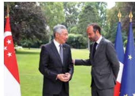
Prime Minister Lee with (top) President Macron and (above) Prime Minister Édouard Philippe

According to a statement by the Prime Minister's Office, the visit also comes as, "both countries commemorate the 20th anniversary of the Republic of Singapore Air Force (RSAF)'s Advanced Jet Training in Cazaux Air Base, and