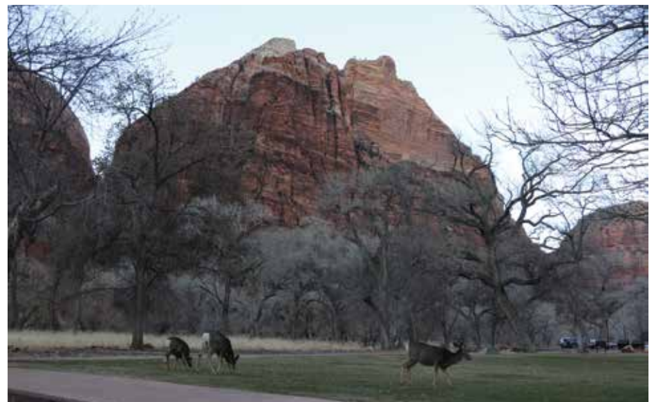
Deers seen from the Zion Lodge with the Zion National Park in the background