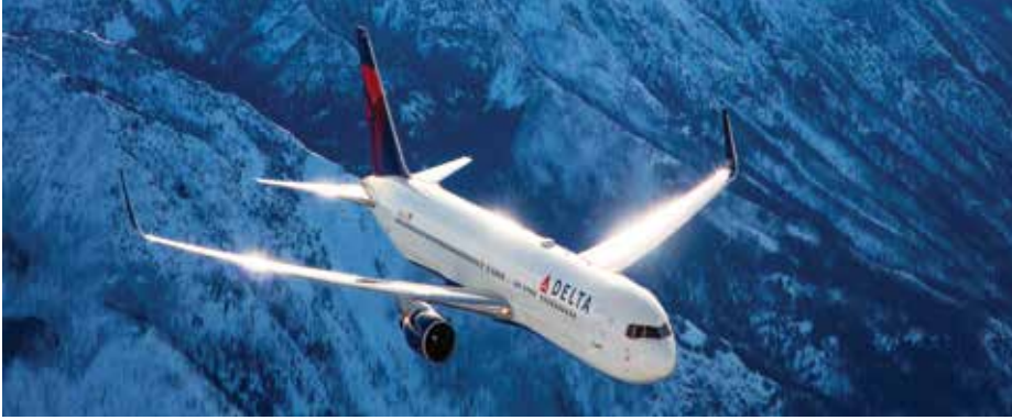
Delta Air Lines, Inc of the United States of America is one of the world's most awarded airlines

and challenging terrains, amazing snow and Wasatch mountain views.