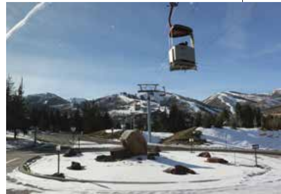
Park City Snow