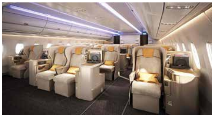
Asiana Business Smartium

Business Smartium seats in Asiana Airlines flights features the first staggered layout in Korea to provide direct aisle access and expandable personal spaces for fully flat bed seat with luxury brand amenity kit, ensuring a pleasant flight experience. Enjoy inflight entertainment on your personal 18.5" wide HD Screen as you relax or snuggle in bed.