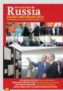
Opportunity Russia 2018