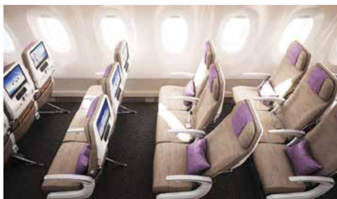
Asiana Economy Smartium

Asiana Airlines is the first airline in Korea to offer inflight WIFI and roaming phone call services, available on A350-900 flights across all cabin class at affordable rates.