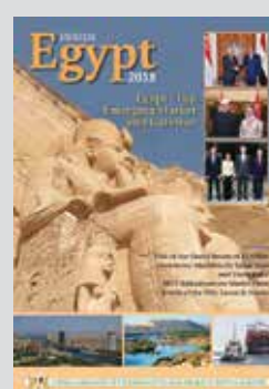
Inside Egypt 2018