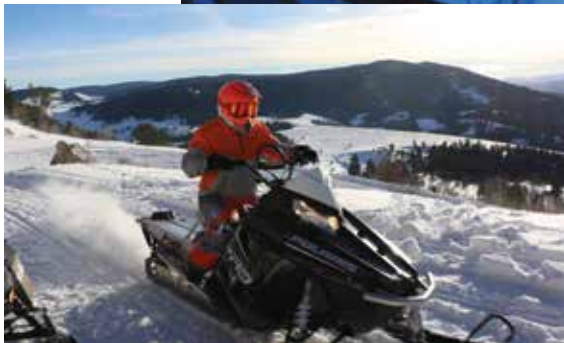
(Top): The State Capital Building in Salt Lake City. (Middle): Cosy 5-star comfort at Stein Eriksen Lodge in Deer Valley. (Left): Snow mobiling near Beaver Creek Lodge