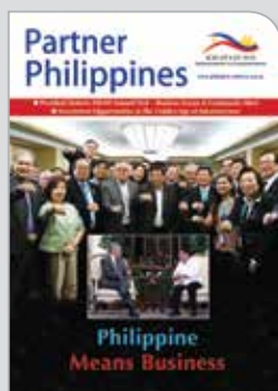
Partner Philippines 2018