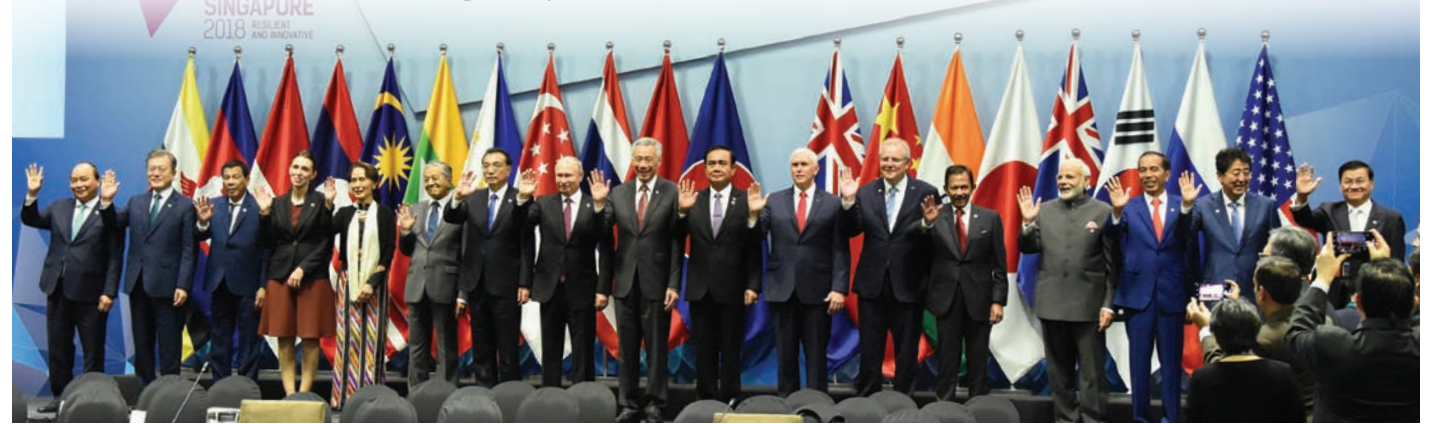
Leaders at the 13th East Asia Summit Plenary Session

...with a total of nine summits between November 13-16, 2018. Here are some highlights of their messages For the full report please visit www.indiplomacy.com EMBER 2010, SINGAPORE