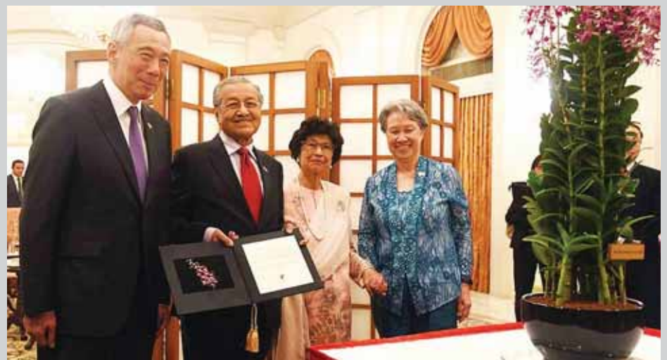
On 12th November 2018 Dr Mahathir and his wife attended an orchid naming ceremony on the Istana grounds. The orchid was named after after Dr Mahathir and his wife, Tun Dr Siti Hasmah Mohamad Ali. It was named Dendrobium Mahathir Siti Hasmah . It is a cross between Dendrobium Kiyoshu Blue and Dendrobium Pink Lips .