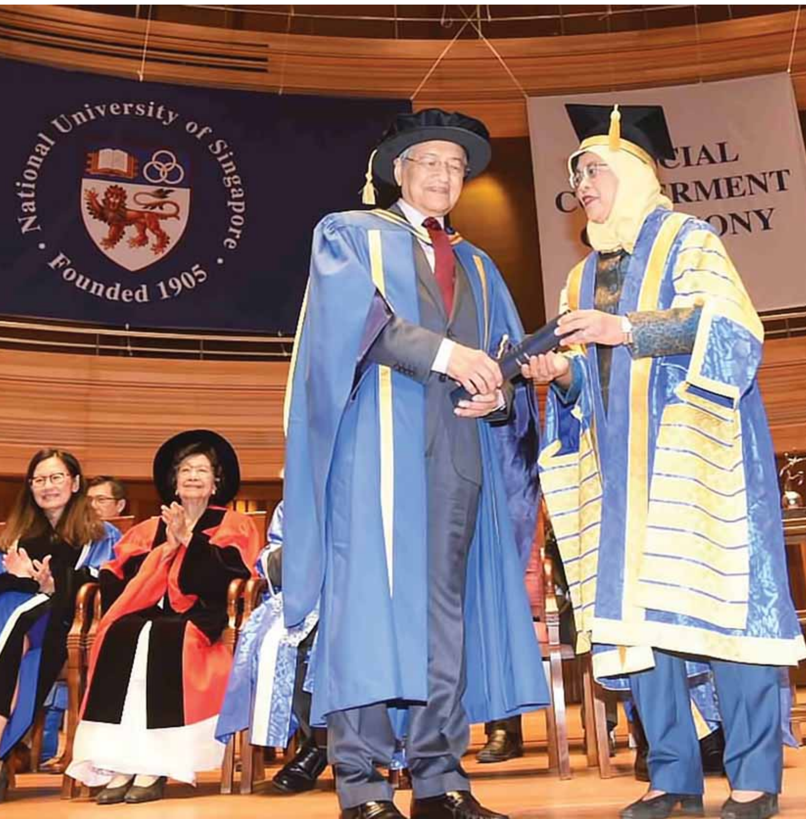
Prime Minister of Malaysia YAB Tun Dr Mahathir Mohamad (Medicine '53) was conferred an NUS Honorary Doctor of Laws, and his spouse, Tun Dr Siti Hasmah Haji Mohd Ali (Medicine '55) was also conferred the NUS Distinguished Alumni Service Award during the special conferment ceremony

"Tun Dr Mahathir, Malaysia's longest-serving Prime Minister and the world's most senior elected statesman, returned to helm his country's government earlier this year in a stunning demonstration of his abiding love for Malaysia, and his desire to enhance growth and prosperity for his countrymen... NUS salutes his visionary excellence and exceptional leadership of one of Southeast Asia's most vibrant countries"