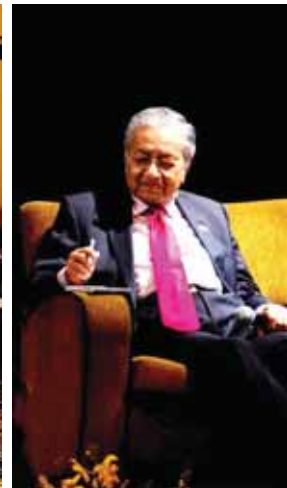
(Above row first & second photos): On 12th November 2018 Dr Mahathir Mohamad addressed the Malaysian diaspora in Singapore at a high tea event at Shangri-La Hotel.