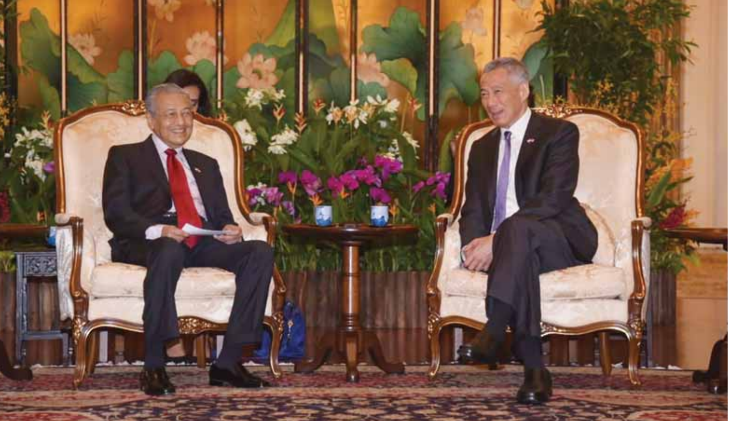
Malaysia Prime Minister Dr Mahathir Mohamad (seated left) during his first Official Visit to Singapore with Prime Minister Lee Hsien Loong

In his first official visit to Singapore since becoming Malaysia's prime minister again, Dr Mahathir Mohamad said, "Malaysia and Singapore are like twins except perhaps the elder twin is a little bit bigger than the younger twin, and a bit older." He was speaking at the official lunch hosted in his honour and that of his wife Dr Siti Hasmah Mohd Ali by Prime Minister Lee Hsien Loong at the Istana on 11th November 2018. He also said, "It is not often that we see countries which come together and are separated, and still work together and help each other." He said both also have a role to play in the region and, together, can be effective in helping it grow.