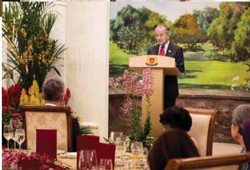
(Top & above): Official lunch reception at the Istana where both leaders spoke on strengthening bilateral ties

According to the Singapore Ministry of Foreign Affairs (MFA) statement the two leaders had a wide-ranging discussion on bilateral