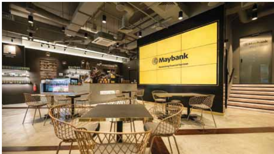
"MSpace at Maybank", a retail banking concept store, is the first branch across the Maybank network to combine a café with banking services.

Reaching out to Malaysians in Singapore and Singaporeans in Malaysia, Maybank offers financial services for customers' cross border needs. It provides banking solutions supported by 20 branches in Singapore and close to 400 branches in Malaysia. These