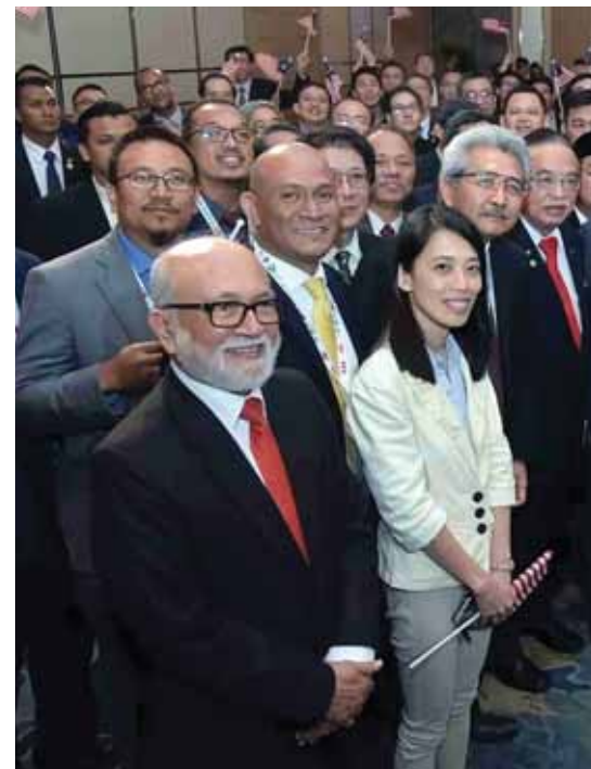
(Above): Dr Mahathir - man of the people held in high regard and affection

We at MASIS conferred upon Tun an Honorary Membership to mark his inaugural visit to Singapore following his election as Prime Minister to Malaysia on the 9th of May 2018. It was an honour to