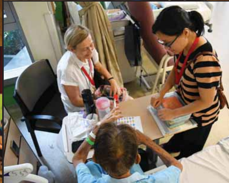
Scenes from.... (top left) the Malaysian Film Festival, (opposite page & top right) theatre for children with special sensitivities. (Above left): Welcome to the panel discussion at the Healing Through Arts Forum and (above right): bedside activity for the Art in Therapy programme