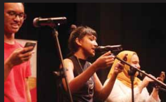
CEX Slam - a bilateral poetry slam between Singapore and Malaysia

For more information please visit www.causewayexchange.com