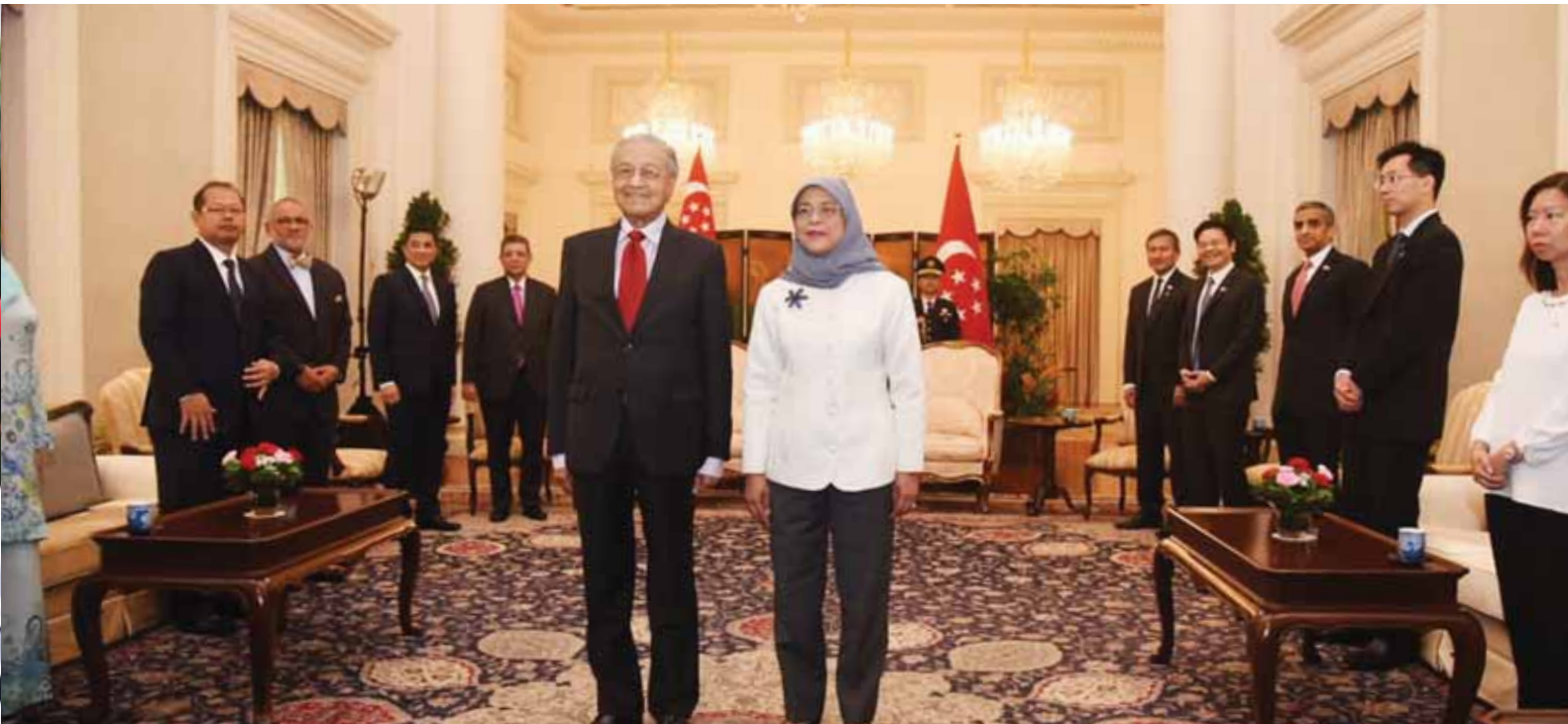
Prime Minister Dr Mahathir with Singapore President Halimah Yacob

During his visit Tun Dr Mahathir Mohamad said Malaysia and Singapore have a role to play in the Southeast Asian region together and both can be very effective in helping the whole region grow. The Prime Minister also noted that contributions of ASEAN and how the formation of the 10-country grouping has played a very important role in the development of the region