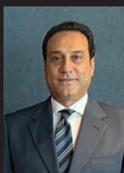
H.E. Mahmoud Assem Mahmoud EIMaghraby Ambassador of the Arab Republic of Egypt to Singapore