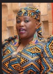
H.E. Madiepetsane Charlotte Lobe High Commissioner of the Republic of South Africa to Singapore