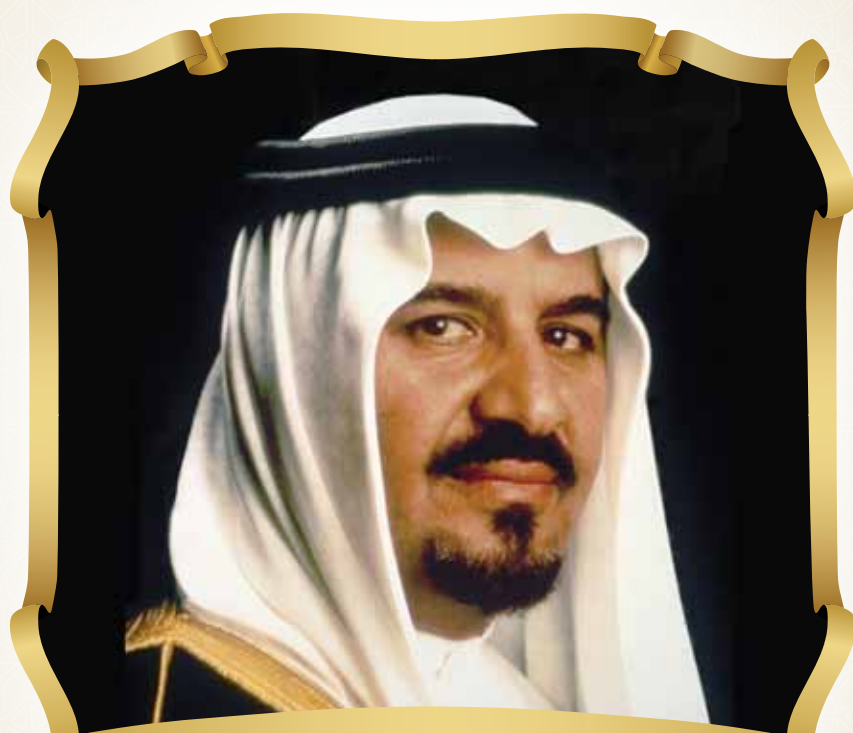
H.R.H. CROWN PRINCE SULTAN BIN ABDUL AZIZ AL-SAUD

Deputy Prime Minister, Minister of Defence and Aviation and Inspector General