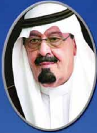
HIS MAJESTY KING ABDULLAH BIN ABDUL AZIZ AL -SAUD THE CUSTODIAN OF THE TWO HOLY MOSQUES