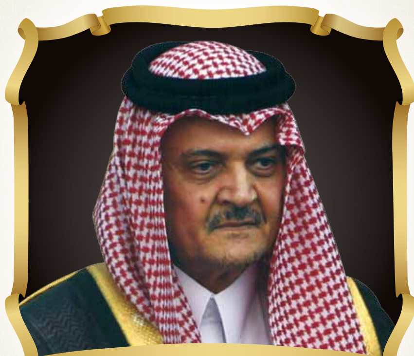
H.R.H PRINCE SAUD AL FAISAL BIN ABDUL AZIZ AL-SAUD