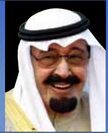
HRH Crown Prince Sultan Bin Abdul Aziz Al-Saud Deputy Prime Minister, Minister of Defense, Aviation and Inspector General