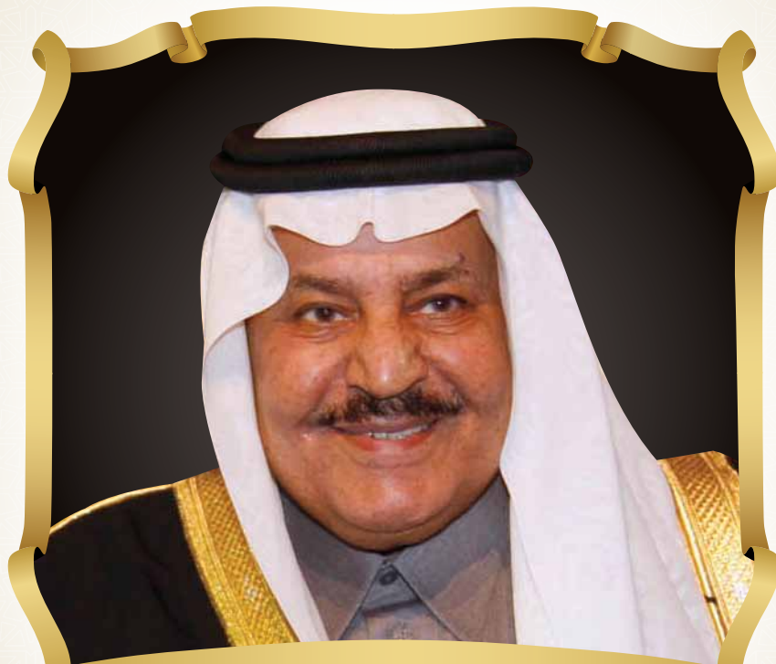
H.R.H. PRINCE NAIF BIN ABDUL AZIZ AL-SAUD

Second Deputy Prime Minister and Minister of Interior