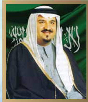
His Majesty KING ABDULLAH BIN ABDUL AZIZ AL-SAUD The Custodian of the Two Holy Mosques