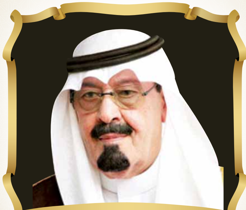
H.M. KING ABDULLAH BIN ABDUL AZIZ AL-SAUD