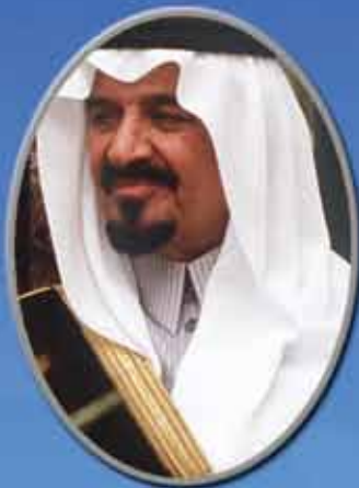
HIS ROYAL HIGHNESS CROWN PRINCE SULTAN BIN ABDUL AZIZ AL-SAUD DEPUTY PRIME MINISTER, MINISTER OF DEFENCE & AVIATION AND INSPECTOR GENERAL

MEMBERS OF THE ROYAL FAMILY AND THE CITIZENS OF SAUDI ARABIA ON THEIR 81 ST NATIONAL DAY CELEBRATIONS ON 23 SEPTEMBER 2011