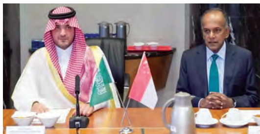
(Top): President Halimah with King Salman on her State Visit to KSA. There were also many other high level bilateral visits (above) Singapore Minister of Home Affairs and Law Mr K Shanmugam and KSA Minister of Interior Prince Abdulaziz

forcing many countries to return to the policies of complete and partial closures to confront the pandemic. This led to social distancing and the interruption of social contacts, whether between the families and relatives, schools and universities or in the workplaces