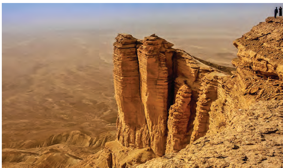
Jebel Firhayan - Edge of the World

Jabal Al Lawz means Almond Mountain. It is over 2,500 metres high with snow almost every year and according to Esquire “making it perfect for a winter hike.”