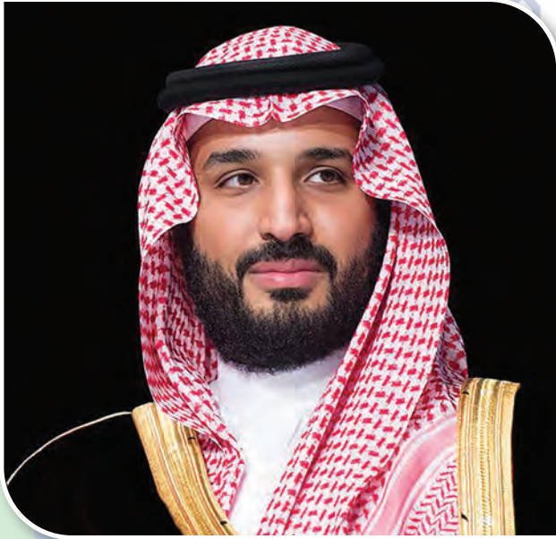
H.R.H. Prince Mohammad bin Salman Al Saud Crown Prince, Deputy Prime Minister and Defense Minister