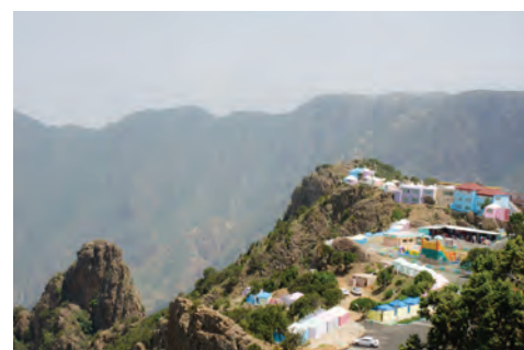
Jabal Alsoudah

The 1000-Year-Old Camel Owners Trail is like a hike through history. It was formed some 10 centuries ago and paved with large stones and zigzag architecture during the Ottoman Empire.