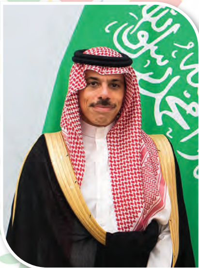
H.H. Prince Faisal bin Farhan Al Saud The Foreign Minister of the Kingdom of Saudi Arabia