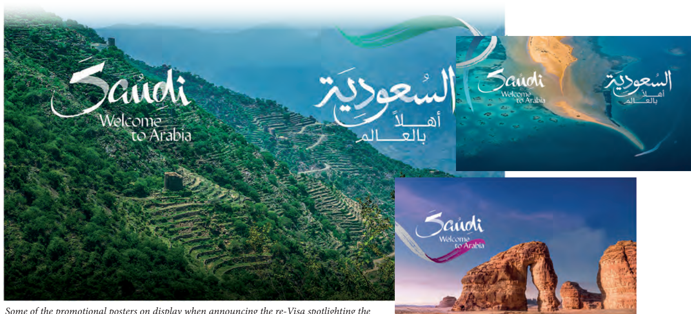
Some of the promotional posters on display when announcing the re-Visa spotlighting the Kingdom's beauty in nature

A historic milestone for the development of Tourism in KSA occurred in October 2019 when visitors from 49 nationalities – including Singapore – were able to get a one-year, multiple entry visas that allows them to spend up to 90 days in the Kingdom of Saudi Arabia!