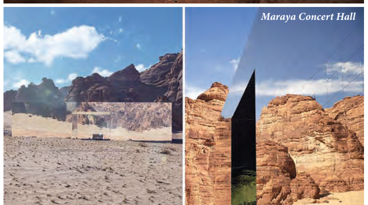
Maraya Concert Hall