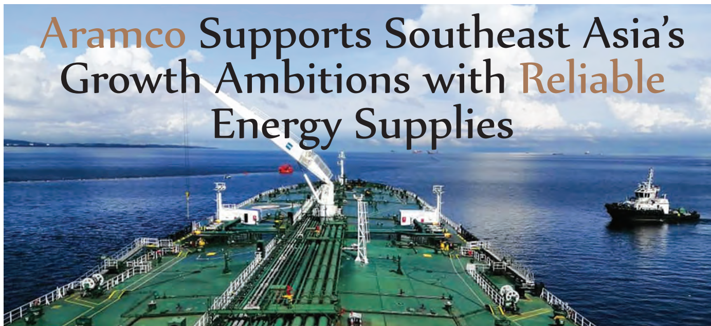
Aramco delivered its first direct Arabian Crude cargo to Brunei Darussalam in June 2020

The Association of Southeast Asian Nations (ASEAN) is a major global hub of manufacturing and trade, as well as one of the fastest-growing consumer markets in the world. Taken as a whole, ASEAN is the third-fastest growing economy in Asia - and it is now the world's fifth-largest economy, and the third-largest in Asia. It is projected to rank as the fourth-largest economy globally by 2050.