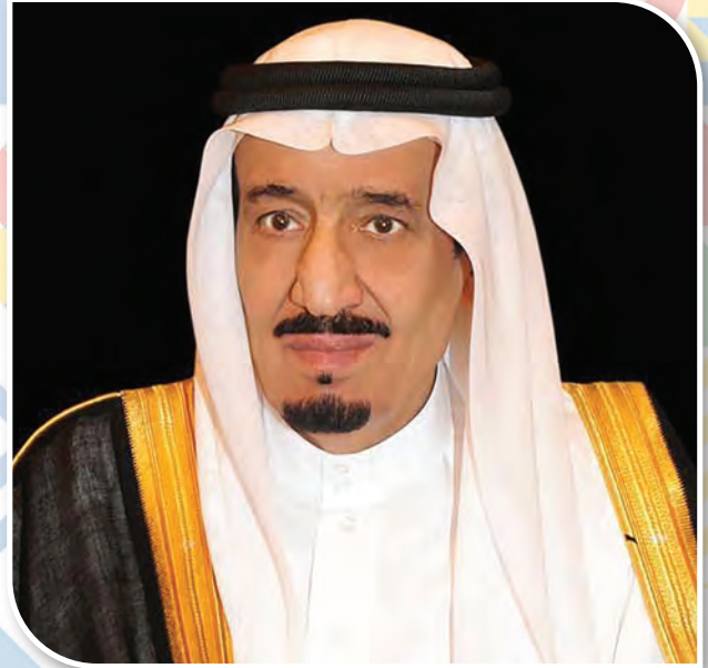
King Salman bin Abdulaziz Al Saud The Custodian of the Two Holy Mosques