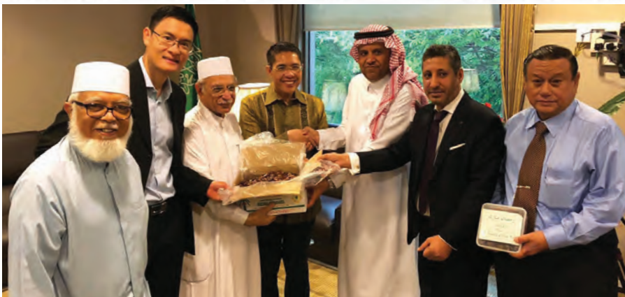
An annual tradition - the Gift of Dates to civil, welfare and religious organisations in Singapore

that visit both countries agreed to establish a Saudi Arabia- Singapore joint committee to increase cooperation in all fields, and also The Saudi-Singaporean Parliamentary Friendship Committee. There was also the visit of His Excellency Senior Minister Mr. Tharman Shanmugaratnam to the Kingdom in January 2019, during which he met His Royal Highness Prince Mohammed bin Salman bin Abdulaziz, Crown Prince, Deputy Prime Minister and Minister of Defense. Also, His Royal Highness Prince Abdulaziz bin Saud bin Nayef, Minister of the Interior visited Singapore and met Her Excellency the President of the Republic of Singapore and Minister of Home Affairs and Law Mr. K. Shanmugam. The Chairman of Saudi Shura Council Dr. Abdullah Al-Sheikh has visited Singapore in 2018 and met Her Excellency the President and his Singaporean counterpart Mr. Tan Chuan-Jin the Speaker of the Parliament.