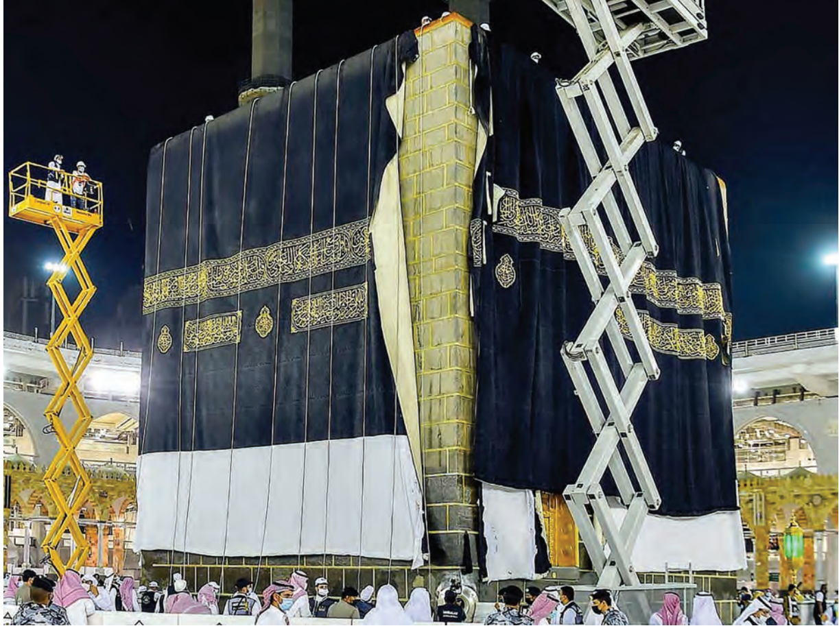
The annual ritual of changing the Kiswah (Ghilaf-e-Kaaba) was held on 18th July 2021 at Masjid al-Haram in Saudi Arabia

Gift shows the close ties that exist between Saudi Arabia and Singapore