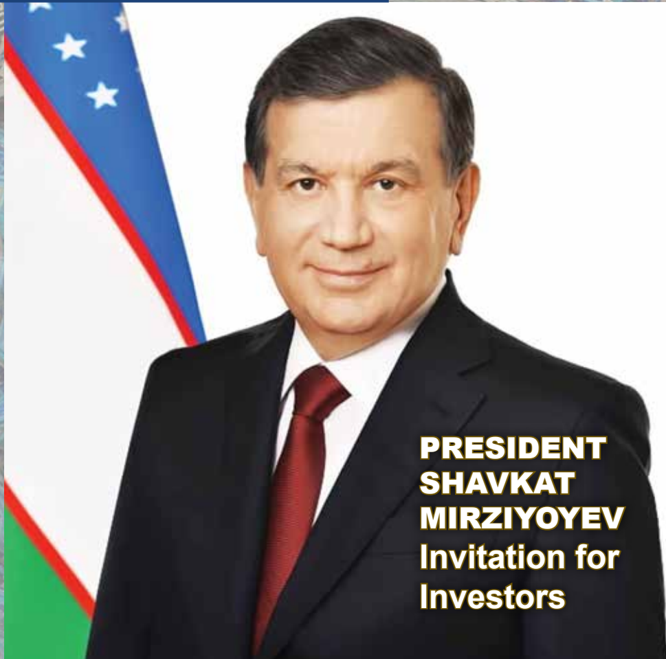
PRESIDENT SHAVKAT MIRZIYOYEV Invitation for Investors